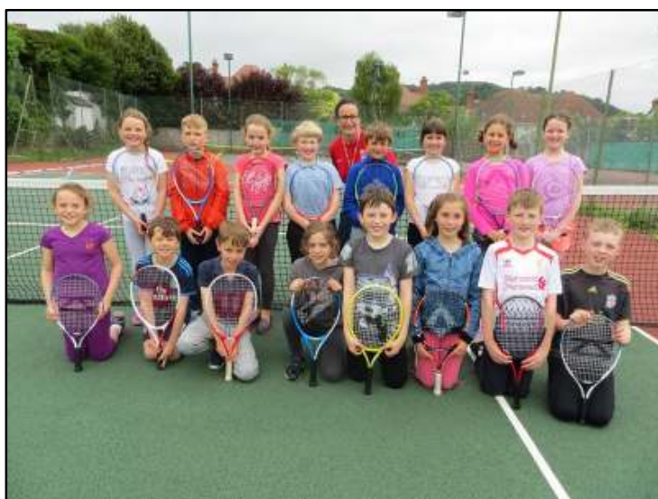
Dunster First School Tennis Team

Thank you to all those parents and carers who helped to transport the children to the event. The picture below shows the sixteen children from Year 3 and Year 4 who represented the school.